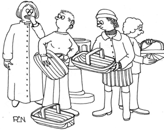
Shirley caught the flower ladies red-handed, dealing trugs