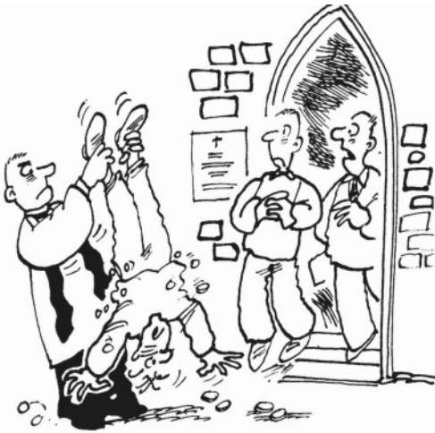
...well you cannot fault the efficacy of the new 'Planned Giving' scheme...